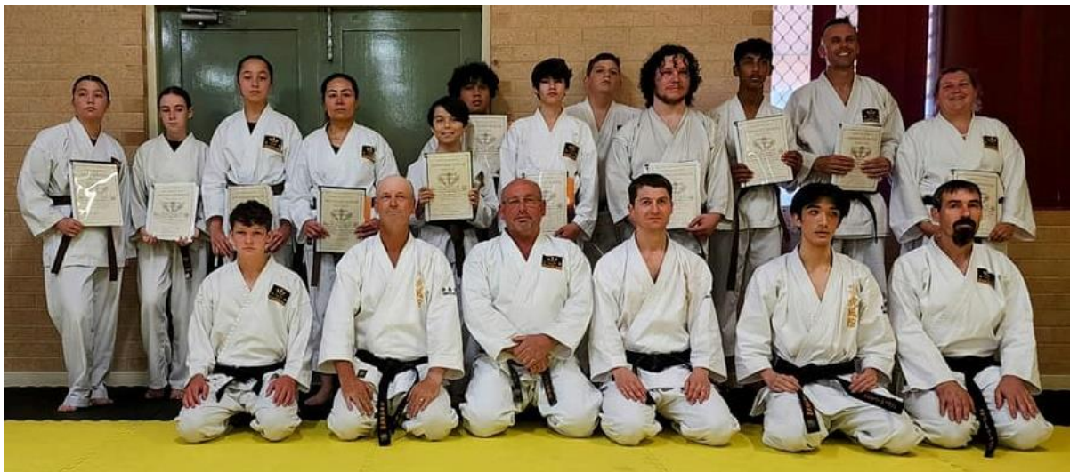
Panel grading in Perth, December 2024