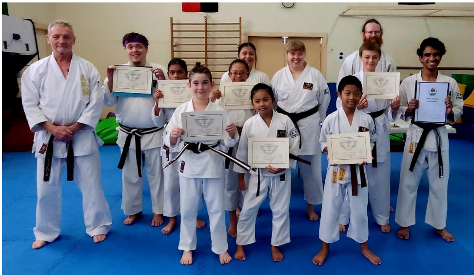
Panel grading in Kalgoorlie, November 2024