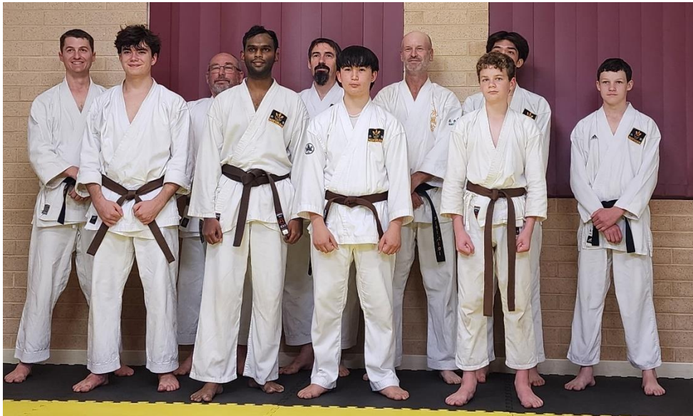
Panel grading in Perth, June 2024