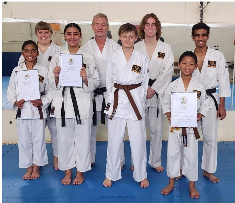
Panel grading in Kalgoorlie, June 2024