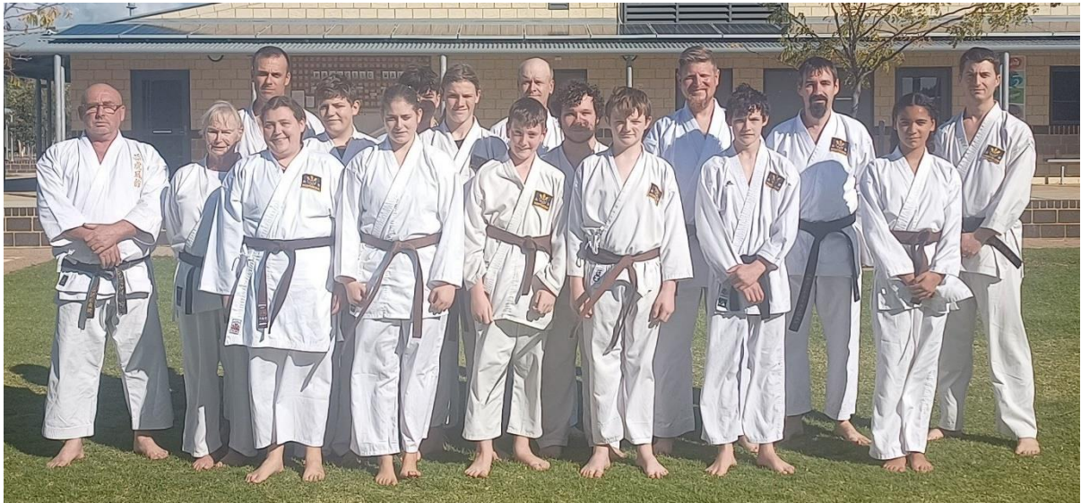
Brown Belt Seminar May 2024