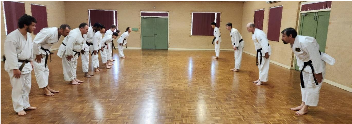
Brown Belt Seminar February 2024