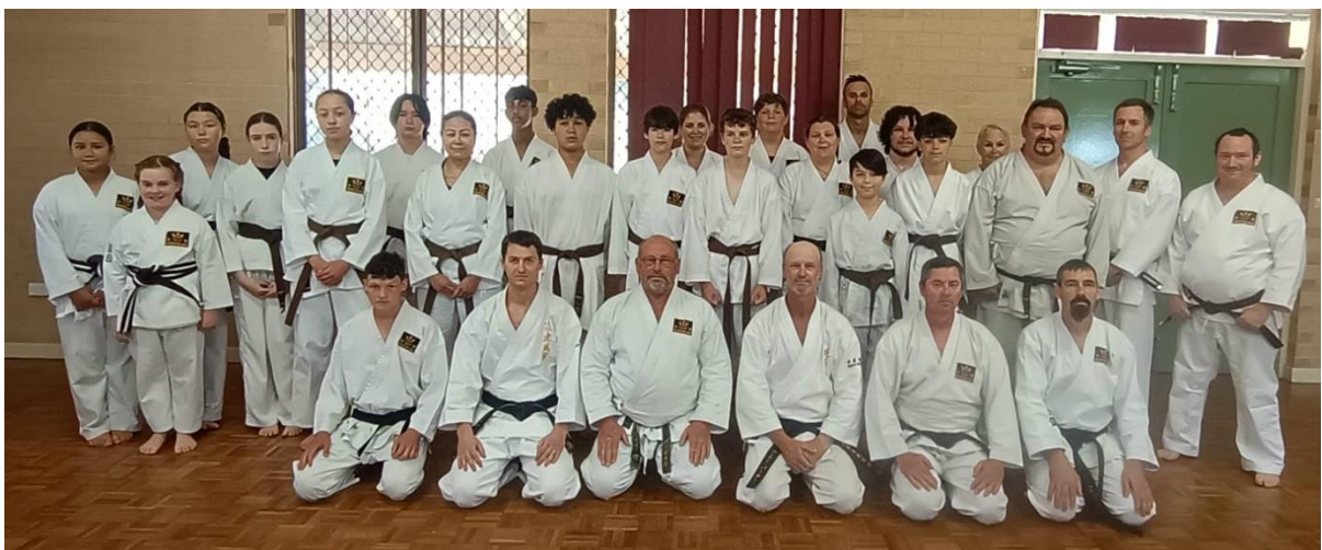
Brown Belt Seminar November 2024