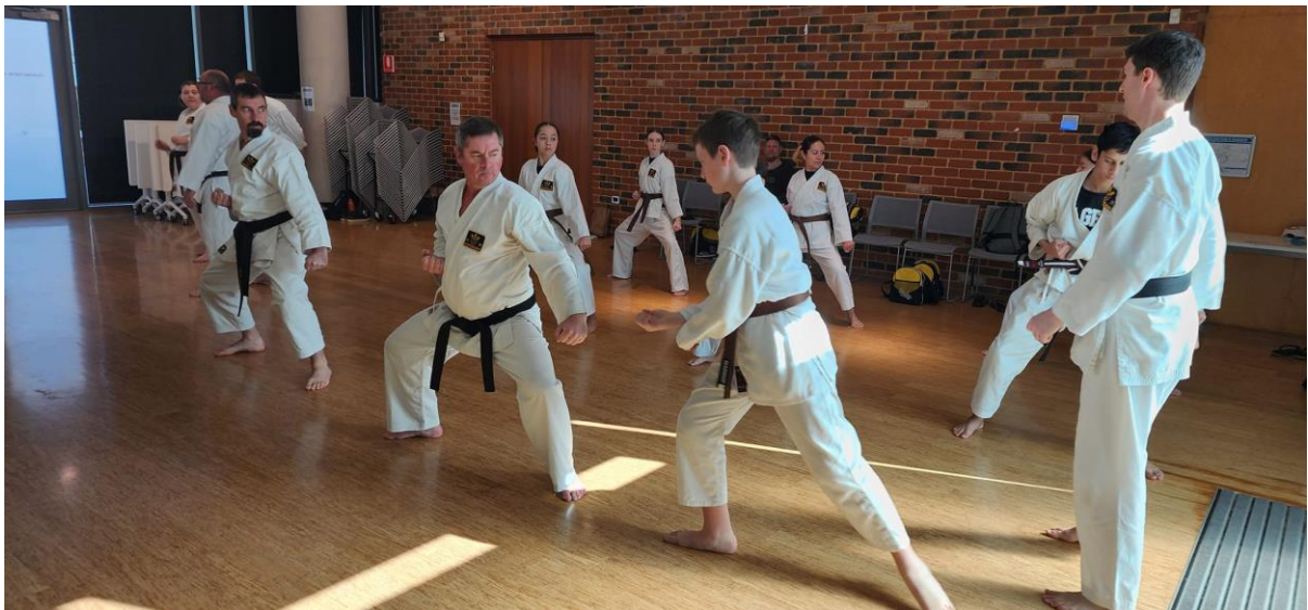
Brown Belt Seminar August 2024