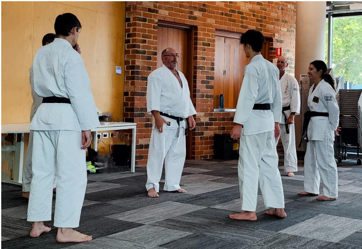
Black belt seminar March 2024