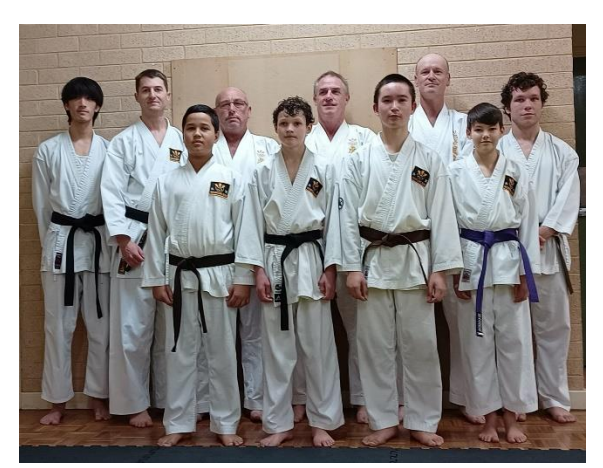
Panel grading in Kwinana, June 2023

Well done to these students for reaching this milestone, and to all the students who passed to 2nd Kyu and 1st Kyu this year.