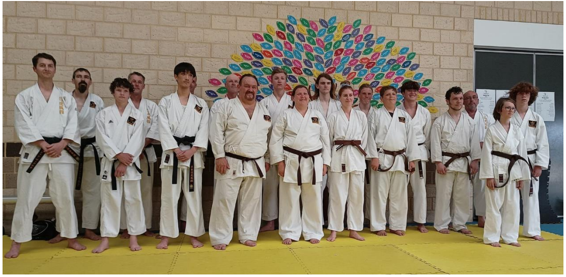
Panel grading in Meadow Springs, November 2023