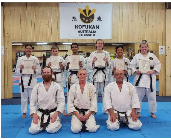
Panel grading in Kalgoorlie, November 2023